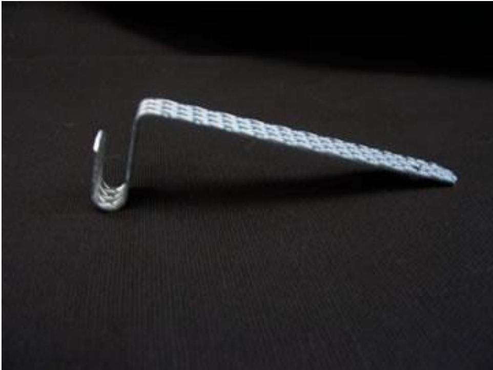
Lift on edge of shingle